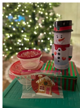
Some of the containers I've used.